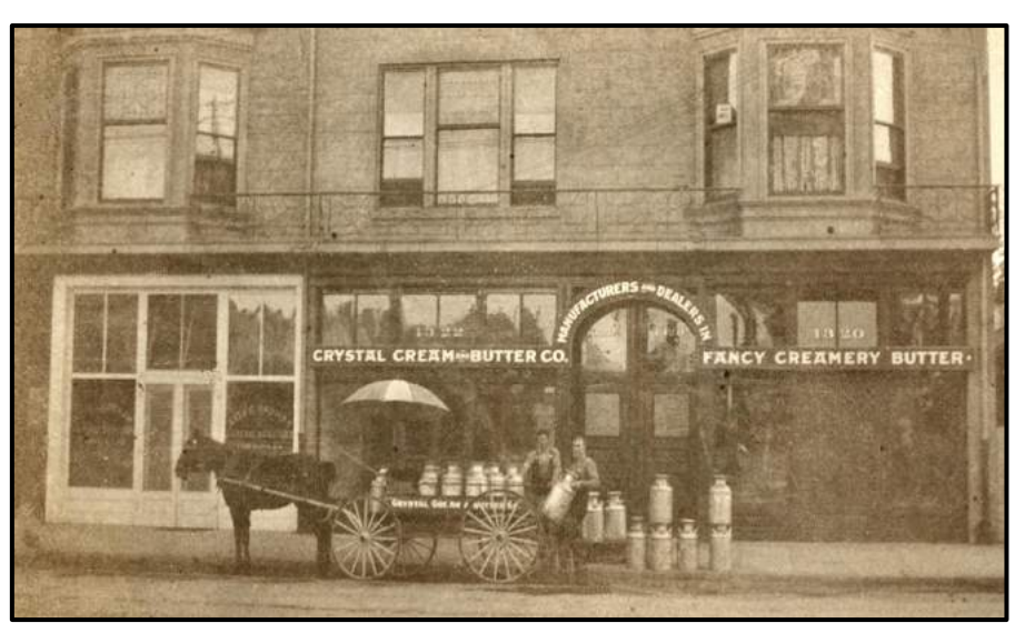
Crystal Cream & Butter Co., 1320-22 J Street (c. 1905)