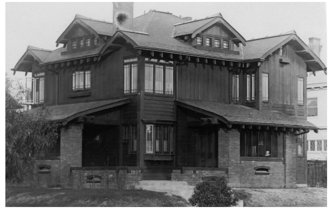
Cranston-Geary House (circa 1912)

As stated in the National Register nomination, the Cranston house is an outstanding example of the Craftsman style that was popular in the first decades of the twentieth century. Its wide porches, intersecting gables, overhanging eaves, projecting dormers, and shaped rafter tails are all typical features of the style. The tall slender casement windows with leaded glass panes are also found in Prairie School architecture, most notably the work of Wright himself. Wright's influence is evident as well in another Craftsman-style house at 1822 G Street, designed for banker George B. Lorenz by Sellon's former business partner, Edward C. Hemmings (1912).