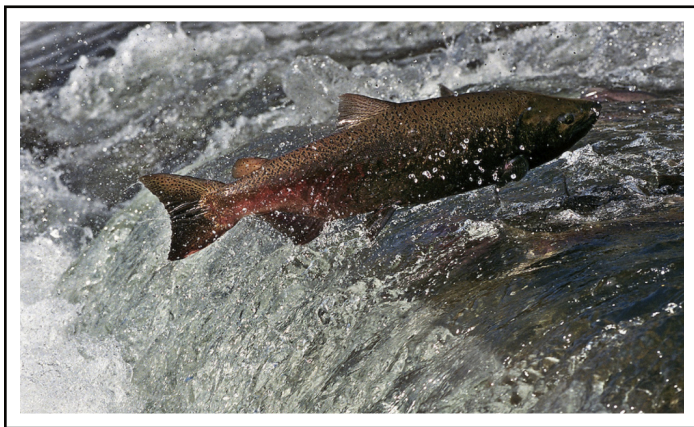
Chinook Salmon Jump

Video about the Chinook salmon and Steelhead trout runs on the American River in 2020: www.youtube.com/watch?v=ymf5XZQCBDg