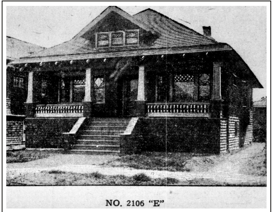
At right: Upper part of a Wright & Kimbrough ad for 2106 E Street ( Sacramento Union , Sept. 24, 1911).