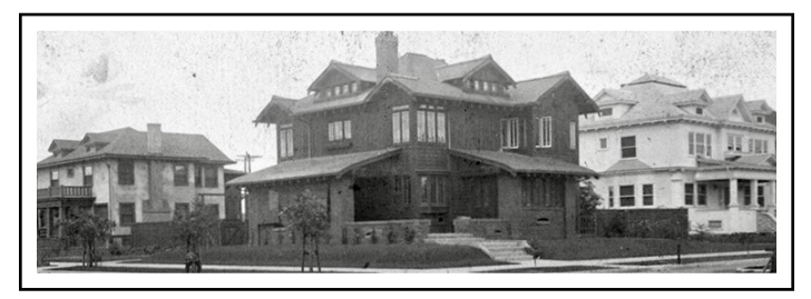
A vintage view of the three houses used for recent BPNA gatherings: 617 21st, 2101 G, and 2115 G (photo taken in about 1911).

In the spirit of the season, and at the request of our hosts, this year's holiday party also will include an optional charity component, with the Sacramento Boys & Girls Club and its Holiday Toy Drive as the recipient. Please consider bringing an unwrapped gift for a child (ages 6-12) or teenager to the party. All donated gifts will be taken to the Boys & Girls Club by their deadline ( Wednesday, December 18 ) so that they can be delivered before the holidays. The Club's website has two lists of gift suggestions for children aged 6-12 and for teenagers (<u>bgcsac.org/how-to-help/holiday-cheer.html</u>). If you prefer to make a financial donation instead, go to: <u>bgcsac.org/welcome.html</u> (click "donate").