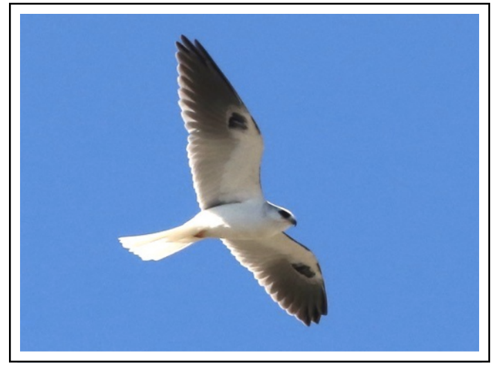
A White-Tailed Kite at Sutter's Landing Park.