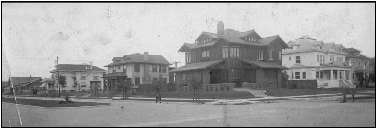
21st and G Streets in about 1910: The Brown house is on the right, next to the corner house, 2101 G Street.