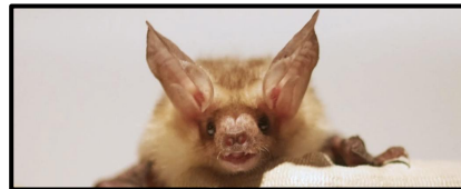
The Pallid Bat has golden fur—just the hue for the Golden State!