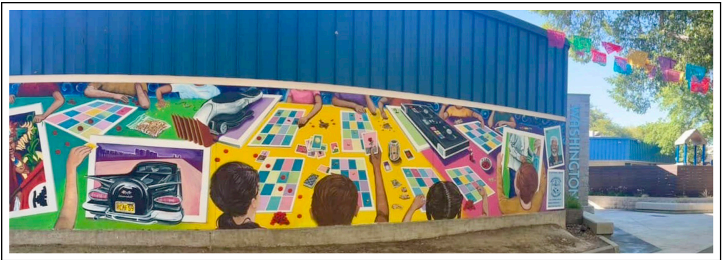
La Lotería del Barrio mural at Washington Elementary School.