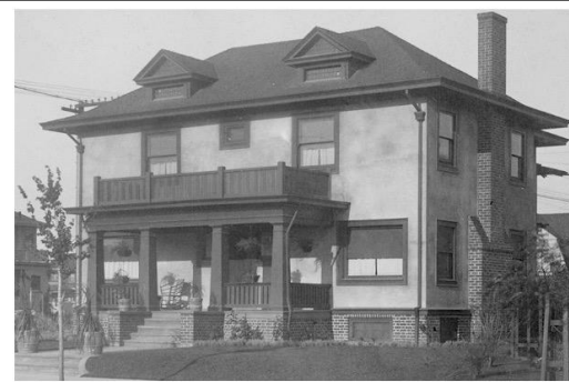
617 21 st (in about 1912)