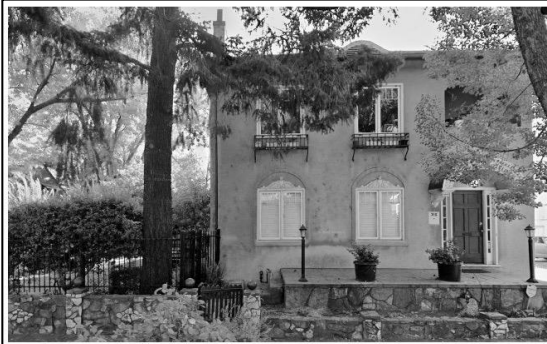
715 25 th (in 2020)