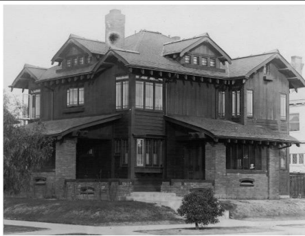
2101 G (in about 1912)