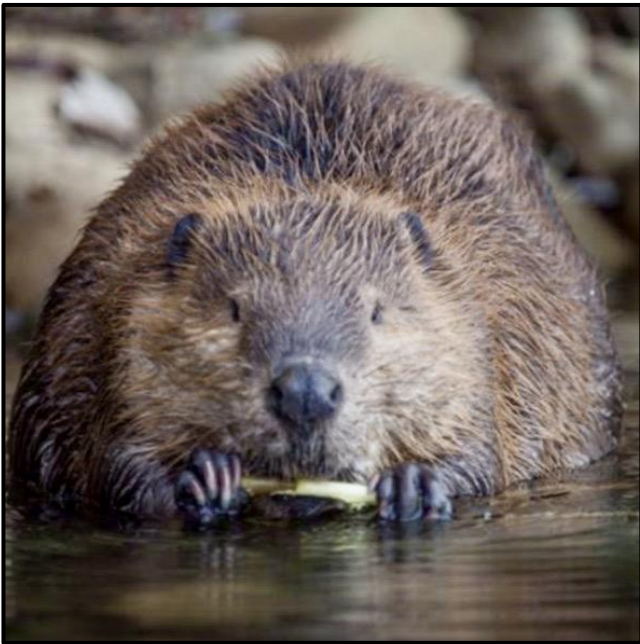
A beaver photographed on the American River Parkway